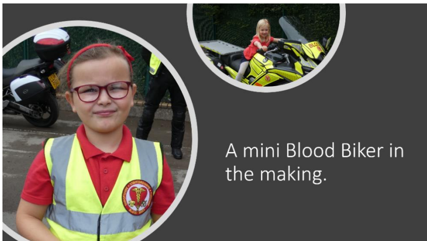
A mini Blood Biker in the making.