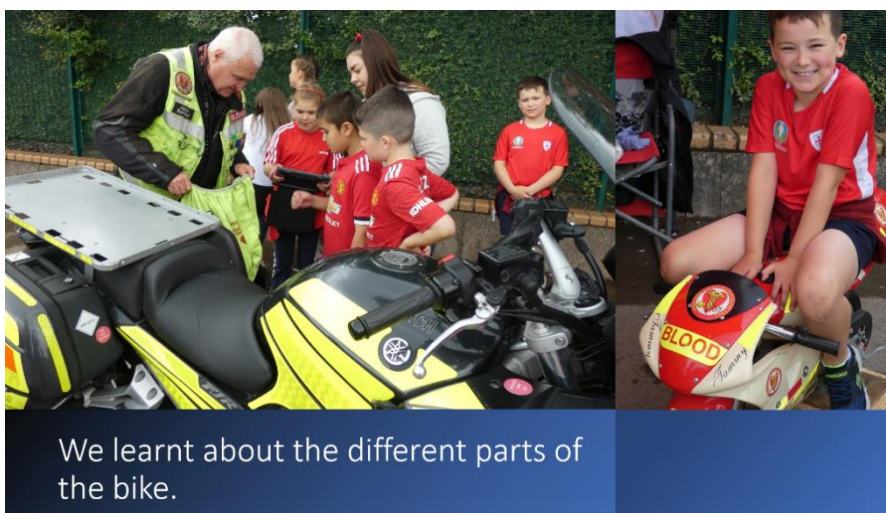
We learnt about the different parts of the bike.