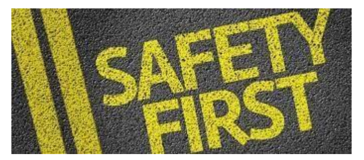
Do you remember learning to cross the road?

Perhaps you recall lessons at school on the Green Cross Code or a parent or carer teaching you to stop, look, listen and think before crossing. We are sure you agree that teaching children about road safety from an early age is very important.